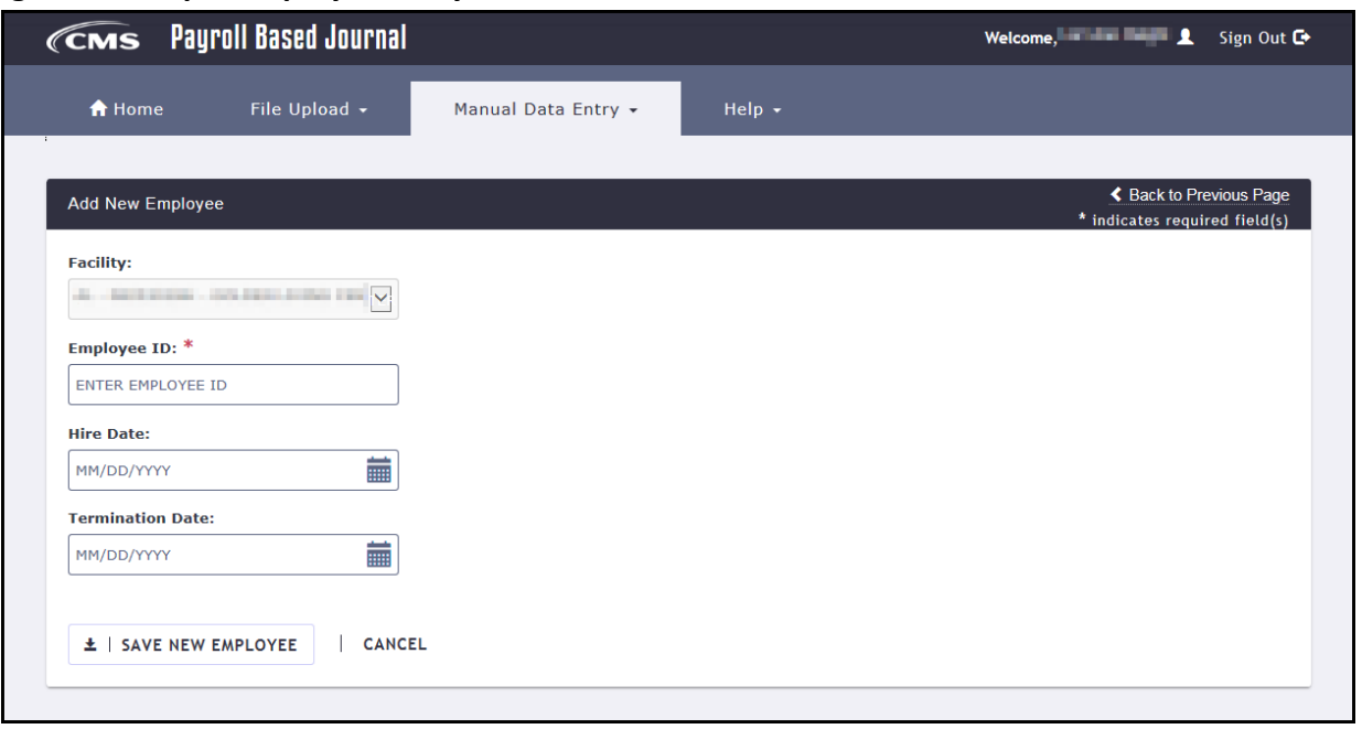
Figure 1: Sample Employee Entry Screen